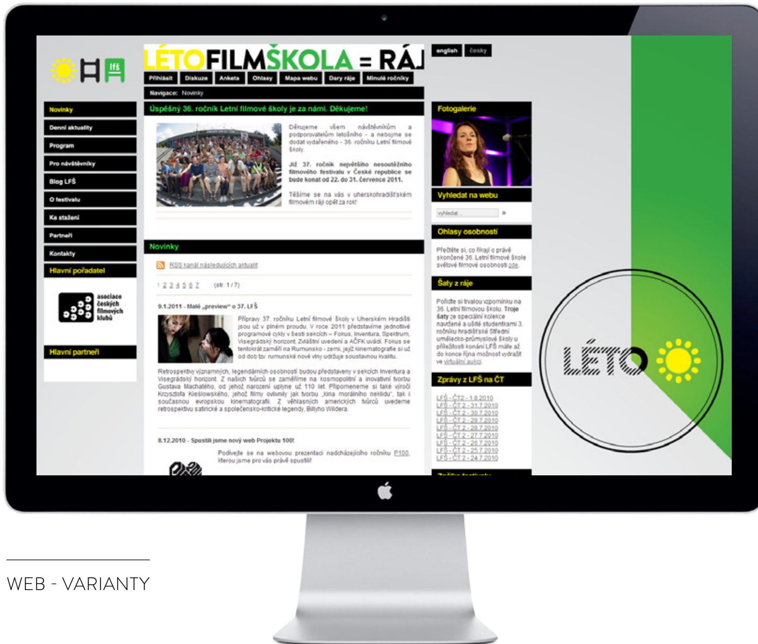
WEB - VARIANTY