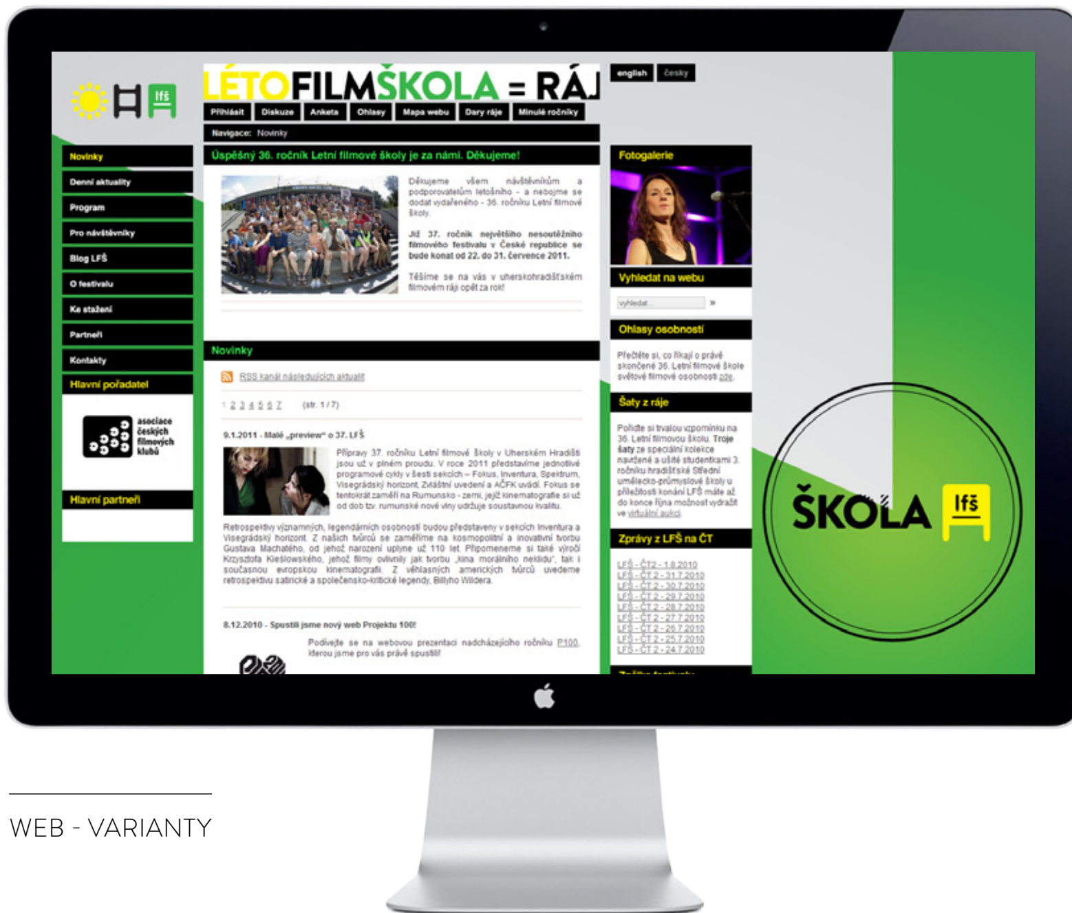
WEB - VARIANTY