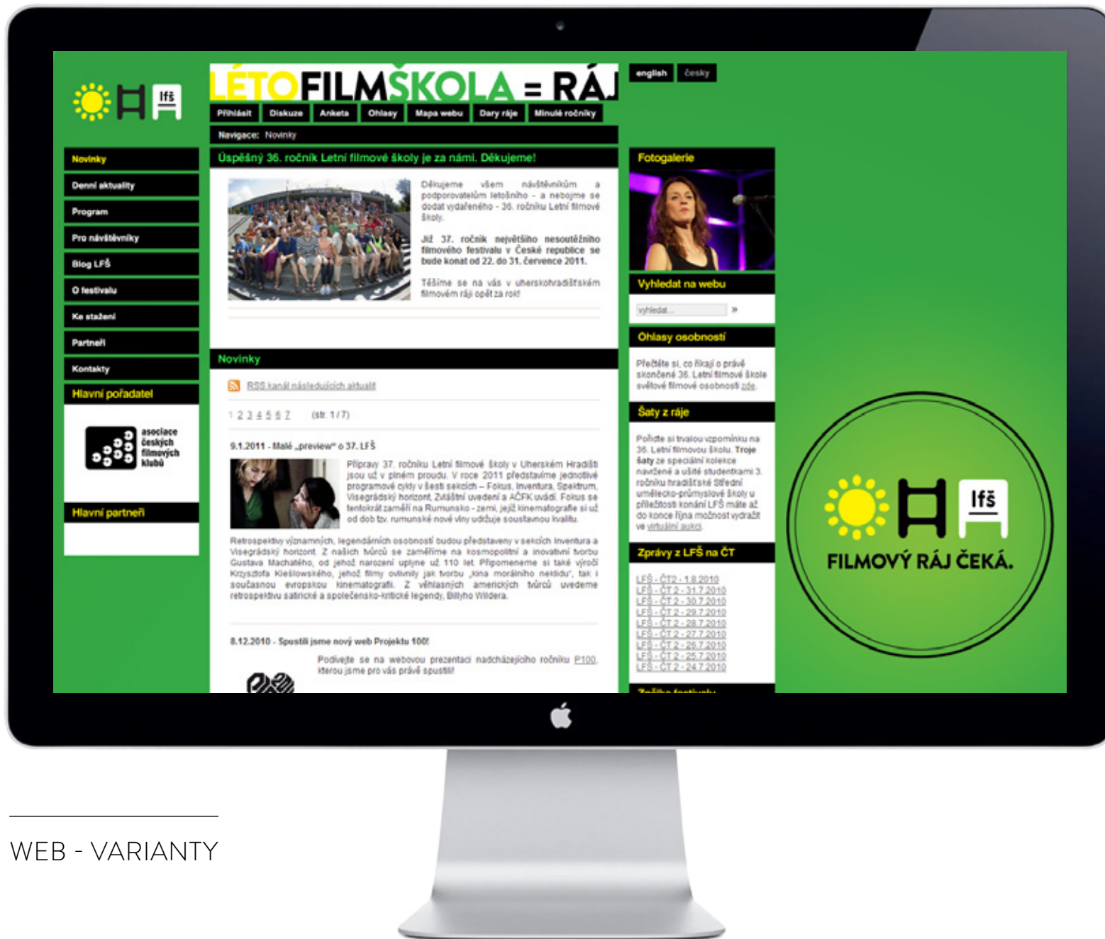
WEB - VARIANTY