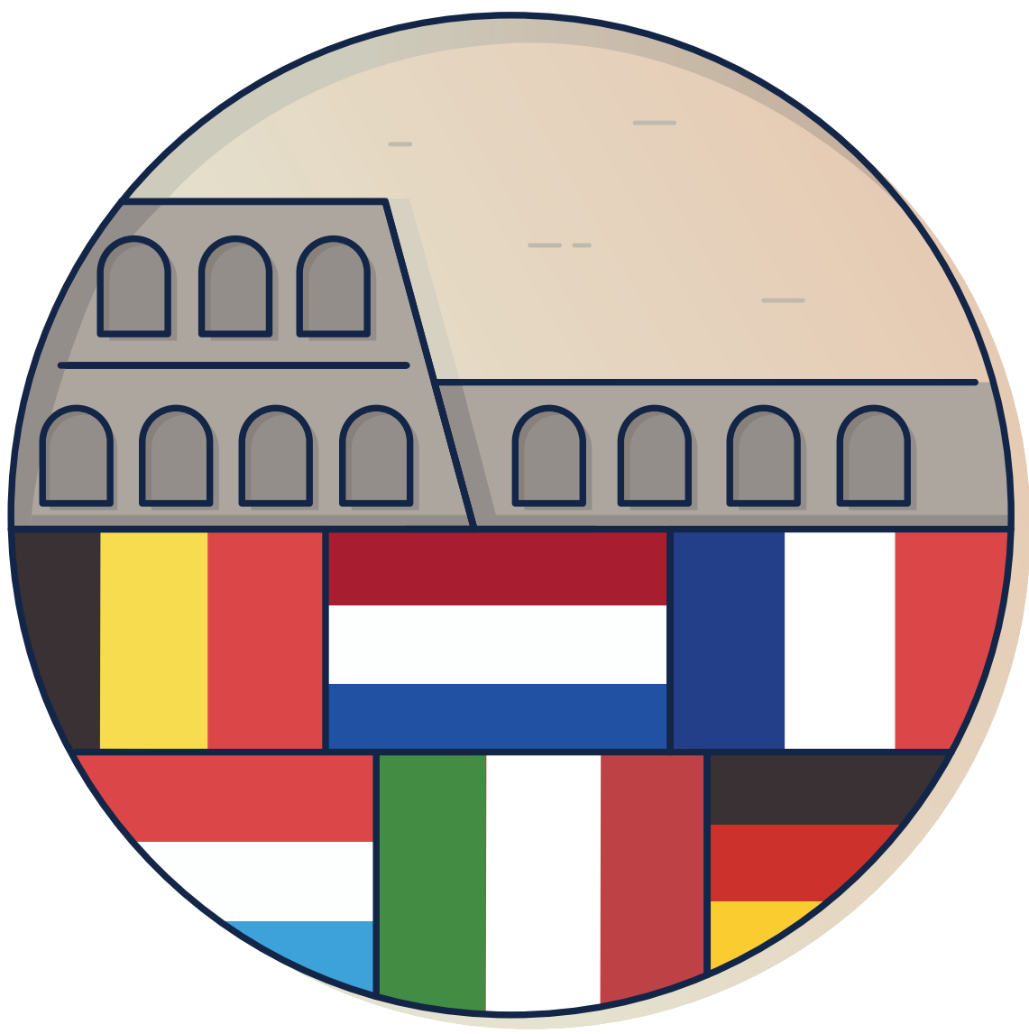
1957 THE TREATY OF ROME ESTABLISHMENT OF THE EEC