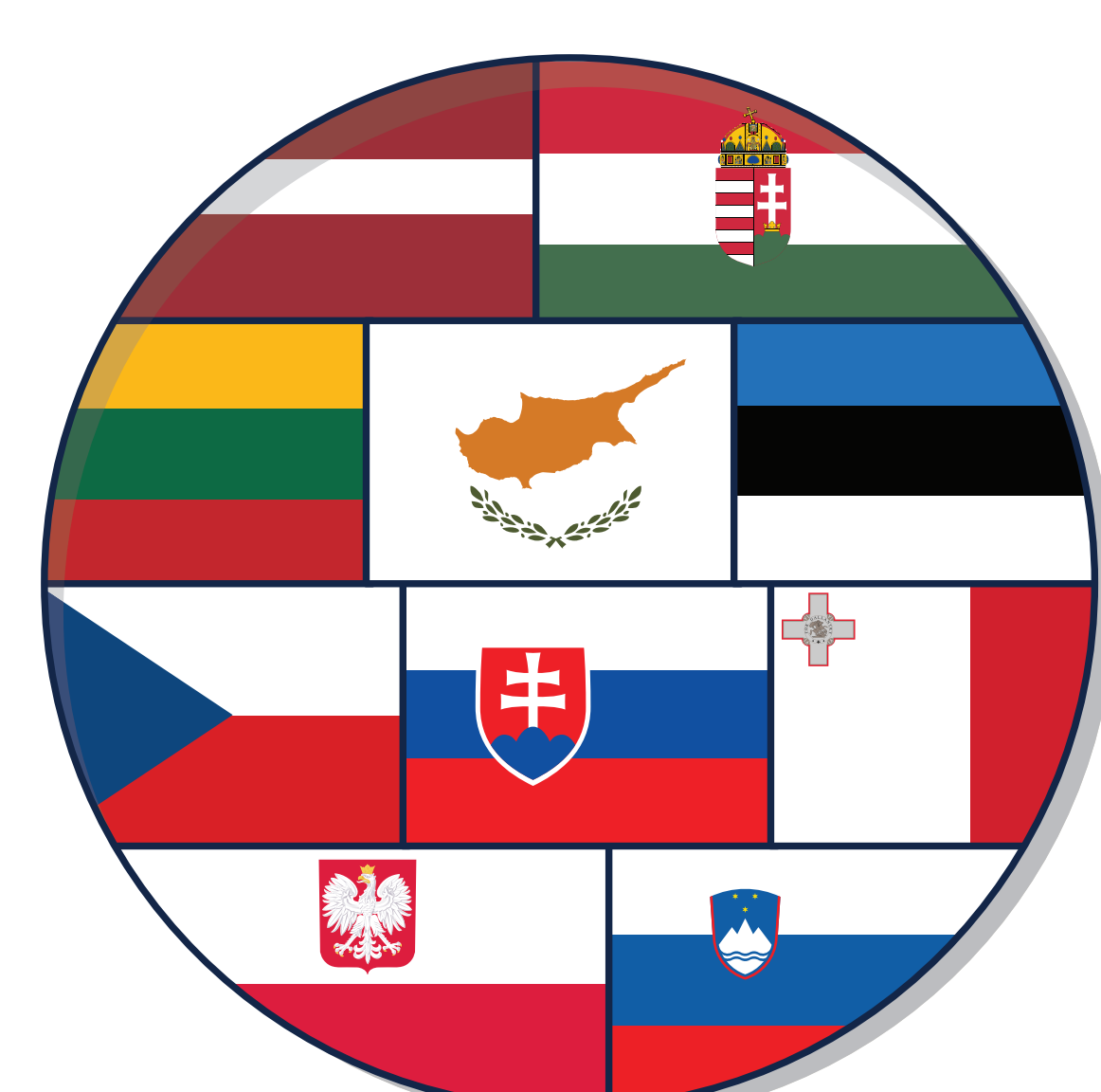
2004 THE EUROPEAN UNION ENLARGED