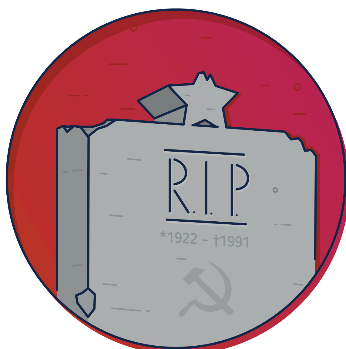
1991 DISSOLUTION OF THE SOVIET UNION