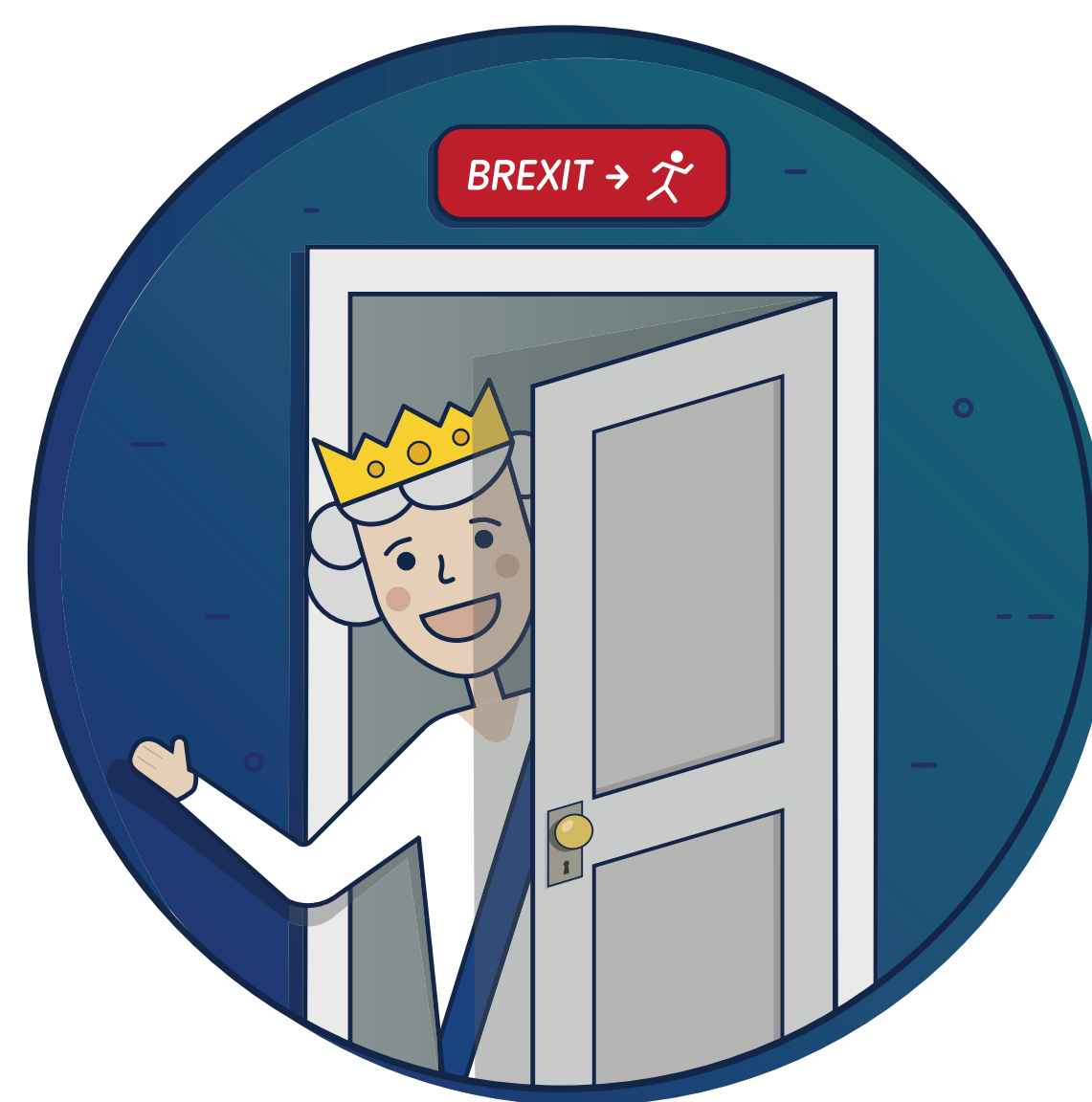
2016 THE UNITED KINGDOM DECIDED TO LEAVE THE EUROPEAN UNION