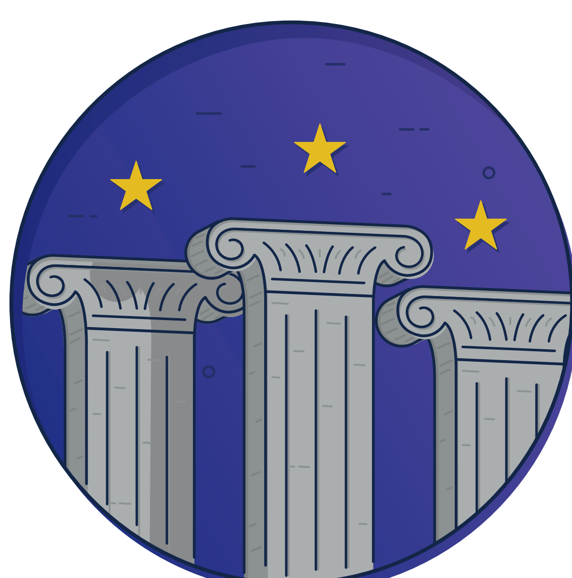
1992 THE TREATY OF MAASTRICHT ESTABLISHMENT OF THE EU