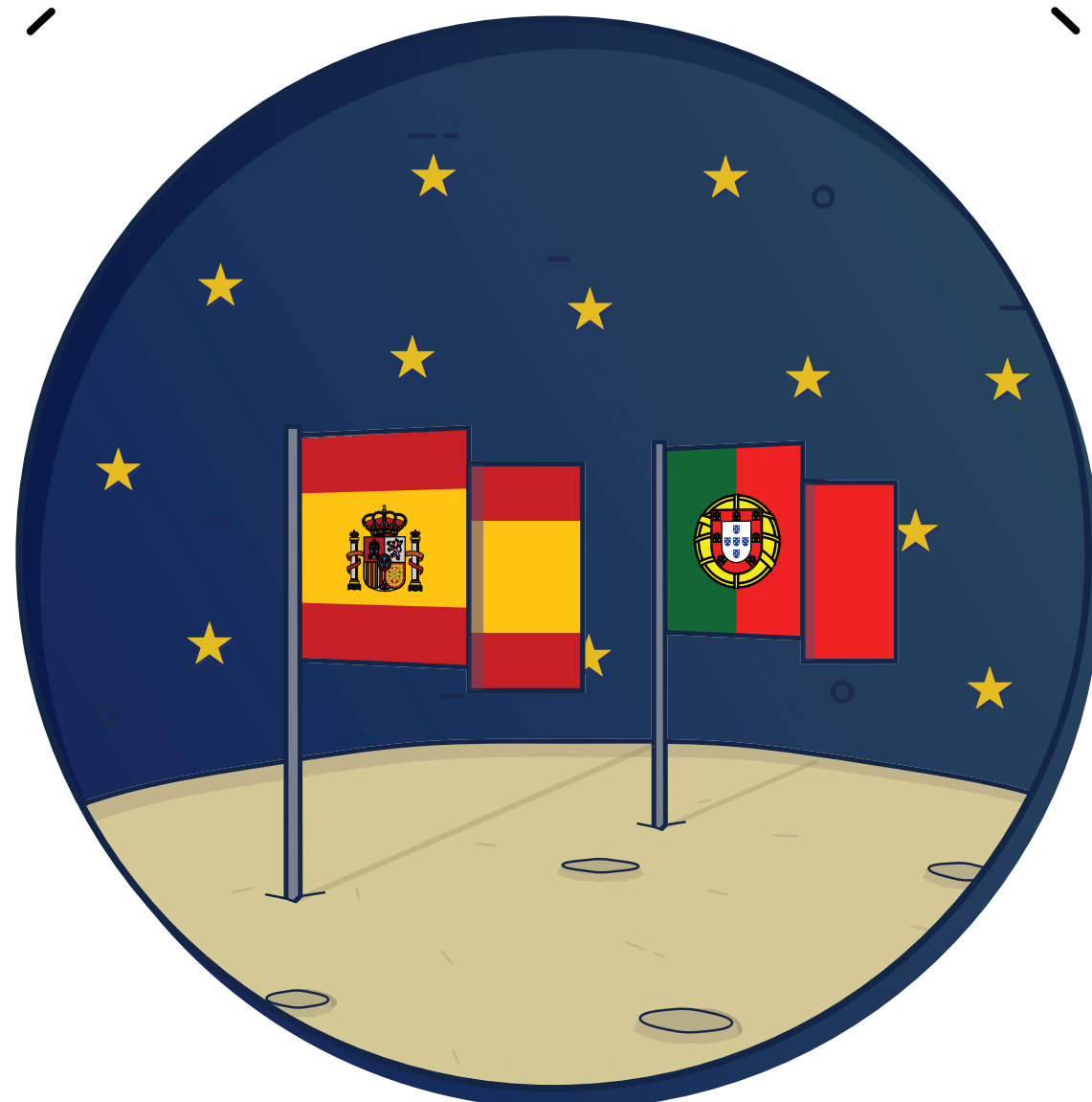
1981 THE COMMUNITIES ENLARGED